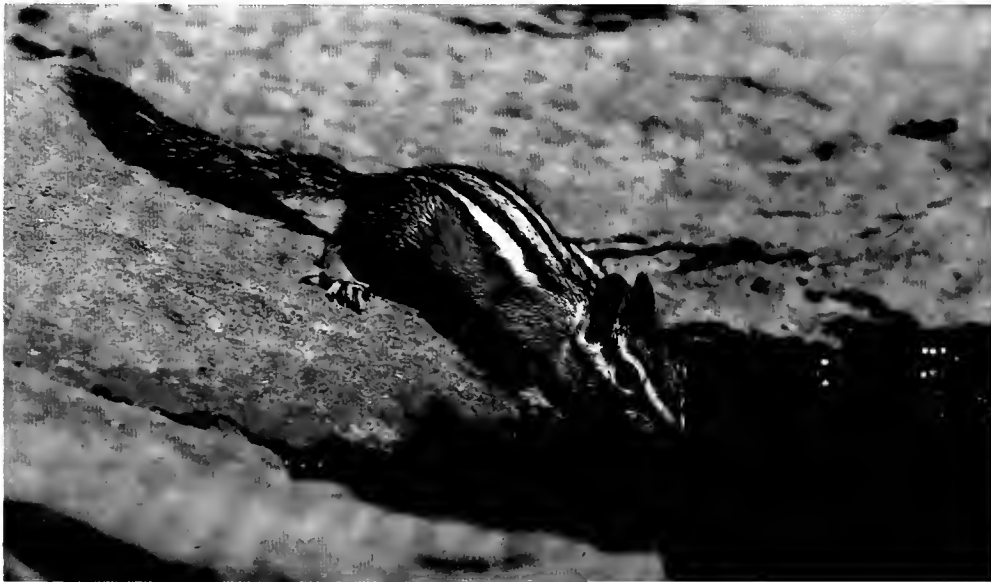
Yellow pine chipmunk: Tom Ulrich